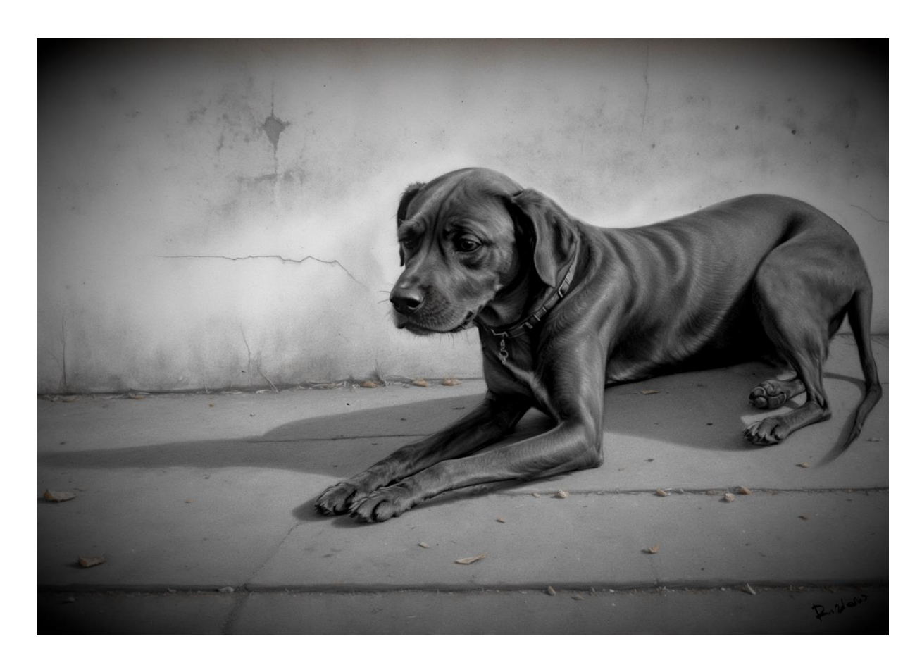
"Abandoned Dog" 2024