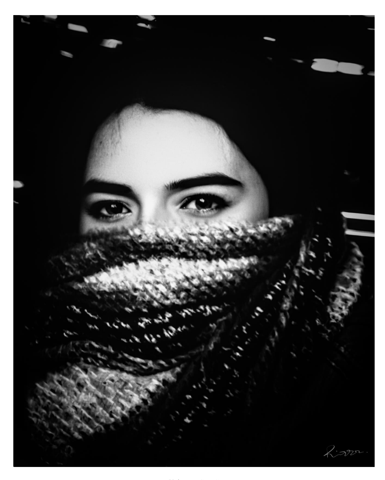
"Unknown Gazes" 2024